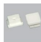
Hole:18128-1 W/O hole:18129-1