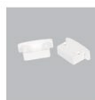
Hole:18128 W/O hole:18129